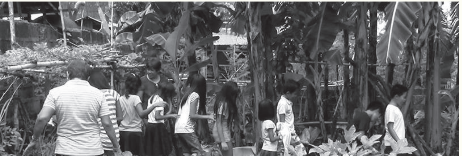
Children in Oromoc, Philippines help to harvest and cook vegetables from the Ibasho garden after school.